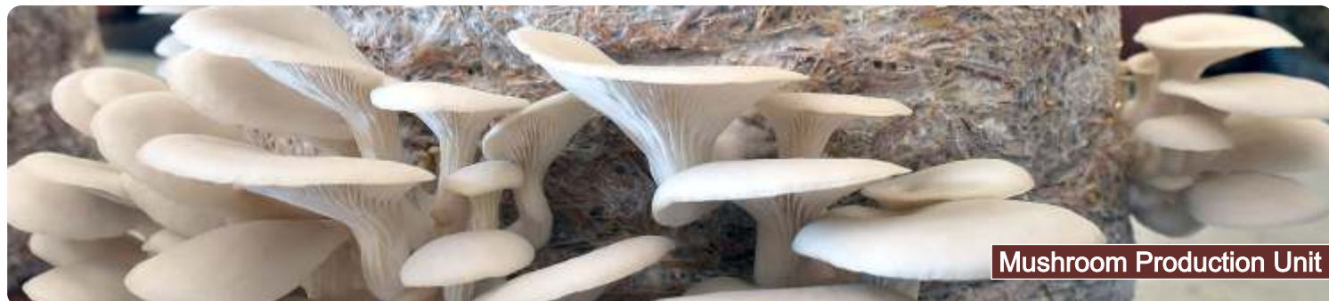
Mushroom Production Unit